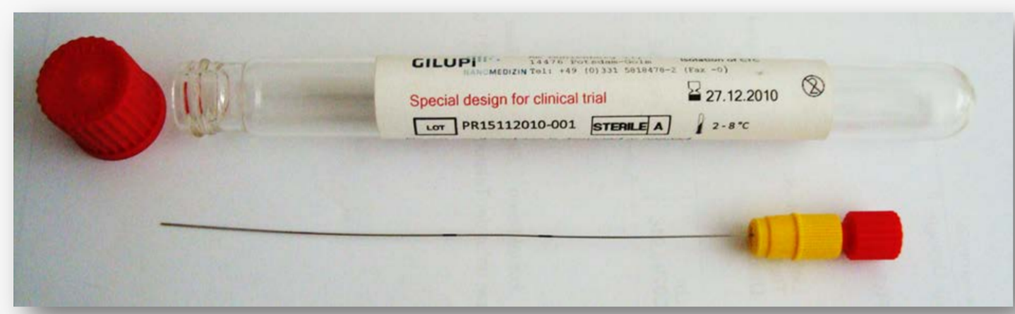
Figure 1: GILUPI Nanodetector for the isolation of rare cells

In vivo detection and isolation of rare cells (e.g. trophoblasts, circulating tumor cells [CTC], etc.) out of an unlimited volume of blood for a comprehensive analysis of their molecular profile.