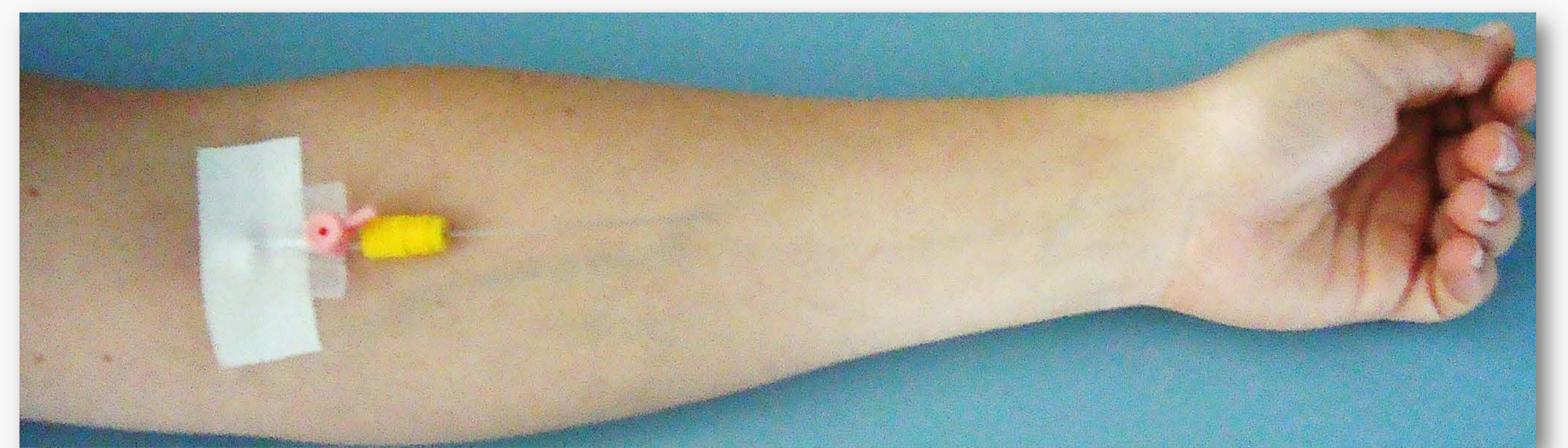
Figure 3: Nanodetector inserted into the arm vein

The Nanodetector is inserted into a patient's arm vein through a cannula for a contact time of less than 60 min.